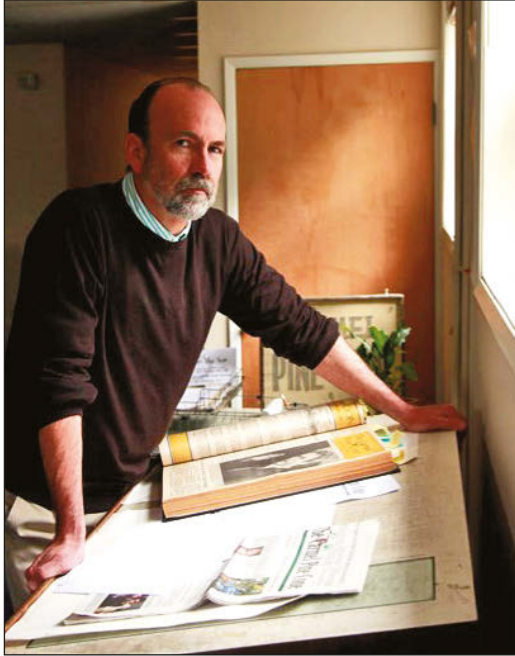
In The Carmel Pine Cone newsroom (2010).

YOUR SOURCE FOR LOCAL NEWS, ARTS AND OPINION SINCE 1915